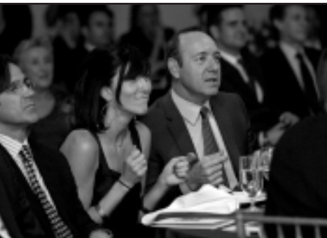
Actress Eve Best and Kevin Spacey enjoy music from the Bobby Darin songbook and featured in the film "Beyond the Sea." Best and Spacey played lead roles in Broadway's recent revival of "A Moon for the Misbegotten."