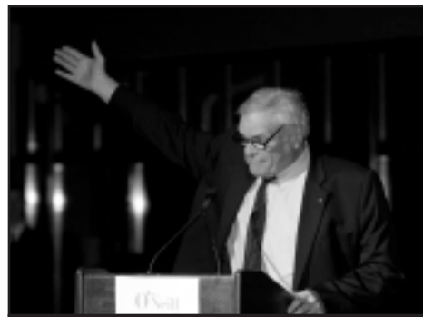
Brian Dennehy, O'Neill board member, addresses guests at the Monte Cristo Award dinner. In presenting the award, Dennehy praised Spacey for his commitment to the theater and for his extraordinary work in roles written by Eugene O'Neill.