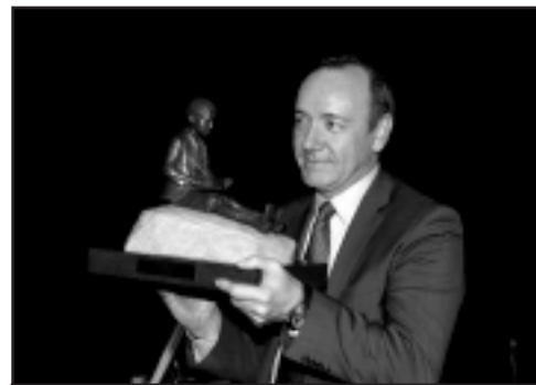
Kevin Spacey accepts the O'Neill's Monte Cristo Award, named after the cottage in New London, CT where Eugene O'Neill summered with his family. Spacey recalled his mentor Jack Lemmon who he met while in high school and later played opposite in Long Day's Journey into Night.